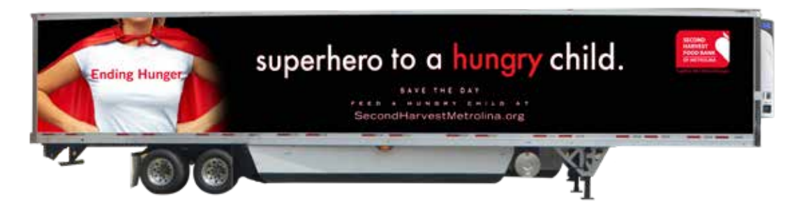
CARES ACT AND FEMA STEP UP TO HELP FOOD BANK DURING COVID-19

Thanks to our friends at Mecklenburg County, Second Harvest Food Bank of Metrolina was able to receive funds to assist us in distributing more fresh produce, meat and dairy products to families affected by COVID-19. Between March 19th and August 31st, the Food Bank provided 10 million more pounds of food than the same time last year. We also distributed over 7 million more pounds of fresh produce, meat and dairy products during this time than we did last year.