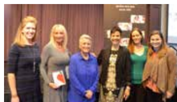
Adams Outdoor Advertising