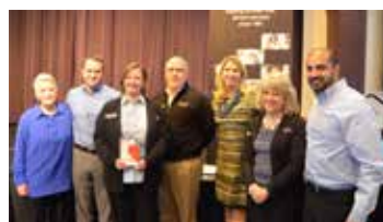
Hendrick Automotive Group