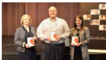
Novant Health Thanksgiving Day Parade