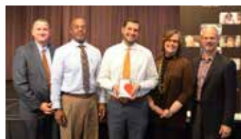
Gordon Food Service