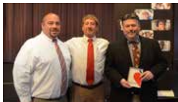
Bimbo Bakeries USA