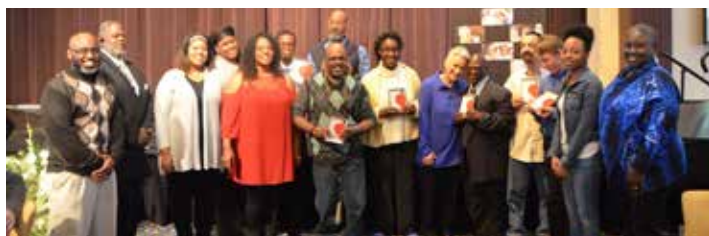
Coach and Client