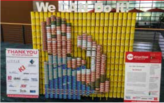
Edifice & Little Best Use of Labels

Thanks to all the firms and their supporters who participated in the 2017 AIA Charlotte CANstruction event. Our friends from the CRVA helped secure the space again for this unique competition. Twelve teams spent weeks planning, and a full morning building these amazing structures at the Charlotte Convention Center. Collectively they provided the food bank with 25,290 pounds of food to help hungry neighbors.