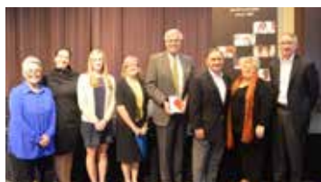
Community Foundation Gaston County