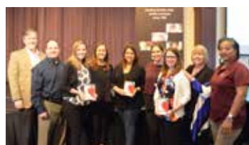
Thanksgiving Turkey Collection