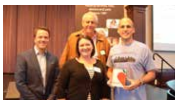
Myers Park United Methodist Church