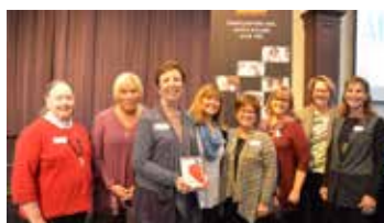
Assistance League of Charlotte