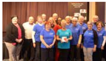
Faith Presbyterian Church