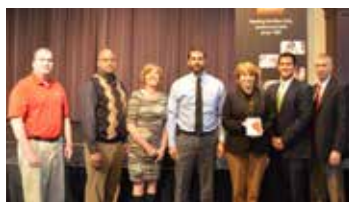
Charlotte Pipe and Foundry