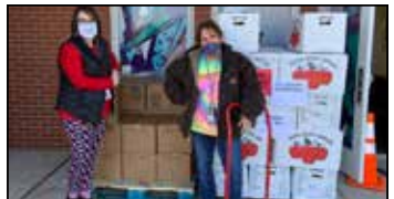
G.E. Massey Elementary Lincoln County