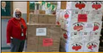
Norris S. Childers Elementary Lincoln County