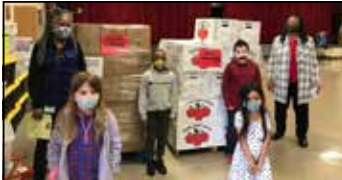
James Love Elementary Cleveland County