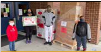
Lawrence Orr Elementary Mecklenburg County