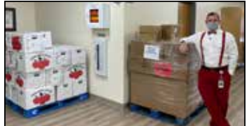
Ebenezer Avenue Elementary York County