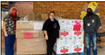
Luther Vaughan Elementary Cherokee County