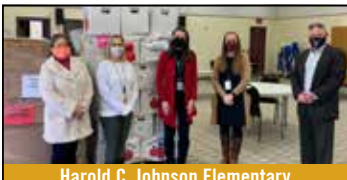
Harold C. Johnson Elementary York County