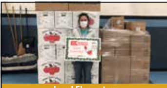
Icard Elementary Burke County