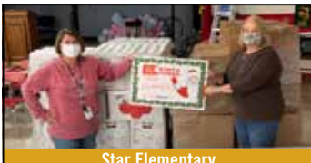
Star Elementary Montgomery County