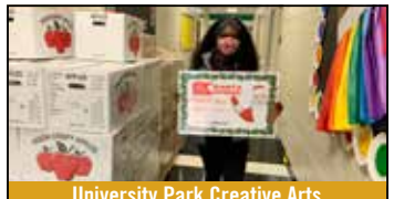
University Park Creative Arts Mecklenburg County