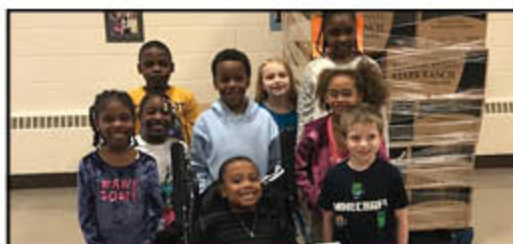
James Love Elementary Cleveland County