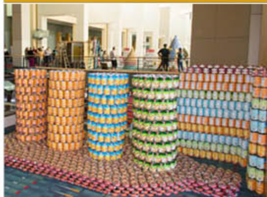
Gilbane-Shelco & LS3P Associates LTD