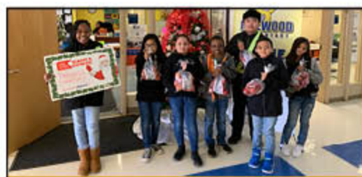
Pinewood Elementary Mecklenburg County