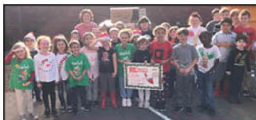
Cliffside Elementary Rutherford County