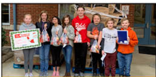
Love Memorial Elementary Lincoln County