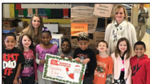
Spindale Elementary Rutherford County