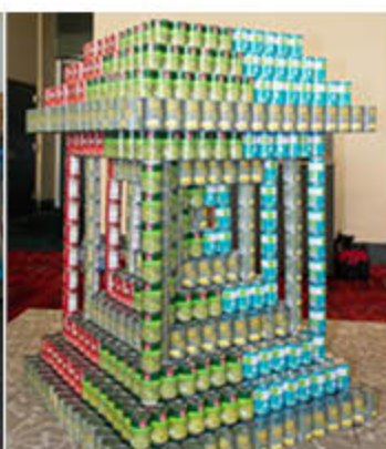
Clark Nexsen & Balfour Beatty