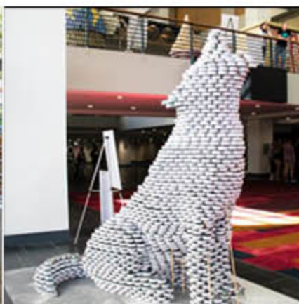
Perkins Eastman Jurors Favorite & Peoples Choice