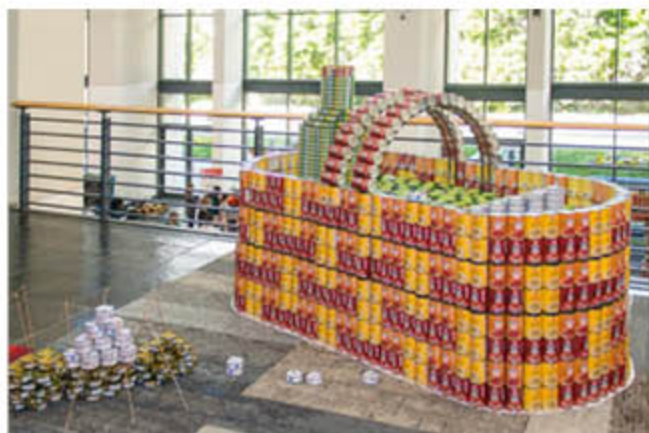
Gresham Smith & Turner