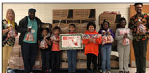
Luther Vaughan Elementary Cherokee County