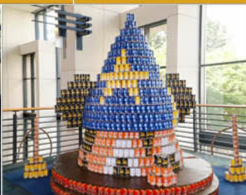
Edifice + Little Diversified Best Original Design