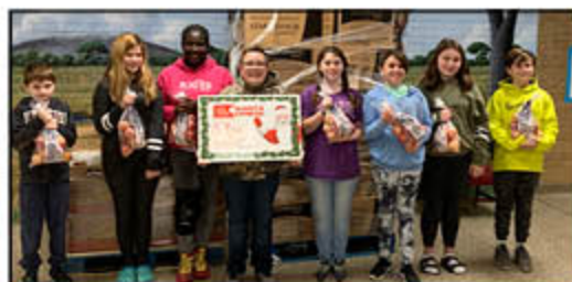
S. Ray Lowder Elementary Lincoln County