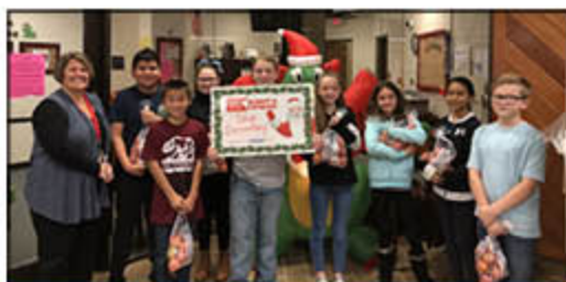
Star Elementary Montgomery County