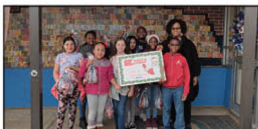
Clinton Elementary Lancaster County