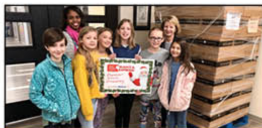
Ebenezer Avenue Elementary York County