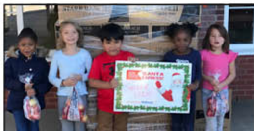
Sadler Elementary Gaston County