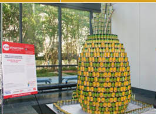
RBA Interiors and Harker Collaborative Construction