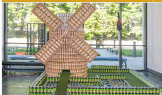
LS3P, Barringer Construction, & Nova Engineering Best Meal