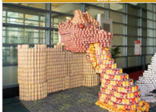
Hendrick Construction & RBA Best Use of Cans & Most Cans Used