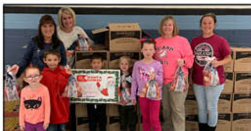
Icard Elementary Burke County