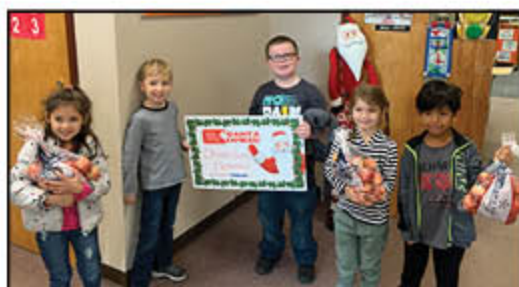
China Grove Elementary Rowan County