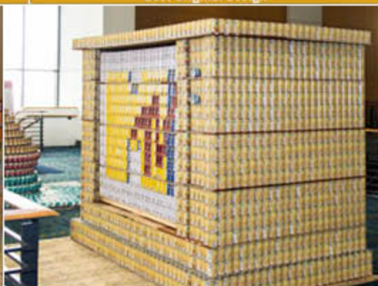
Progressive AE Best Use of Labels