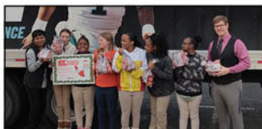
Wadesboro Elementary Anson County