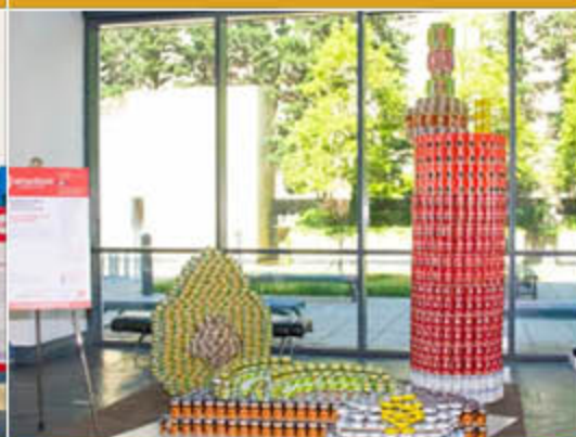
Wright McGraw Beyer Architects & Messer Construction