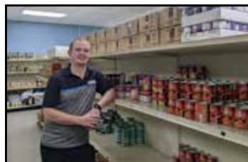
Burke United Christian Ministries Morganton, NC