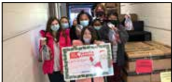
Wadesboro Elementary Anson County