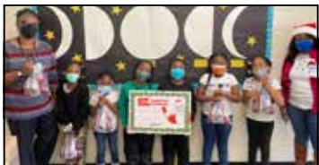
University Park Creative Arts Mecklenburg County