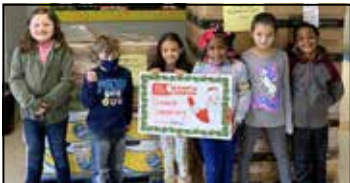
Spindale Elementary Rutherford County