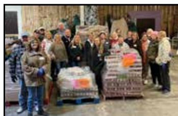
5 Point Church Easley, SC