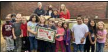
Cliffside Elementary Rutherford County