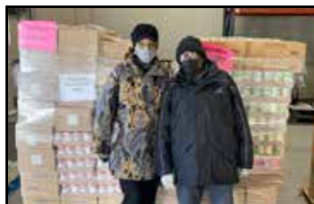
The Manna House Pantry Rock Hill, SC