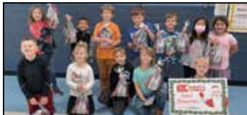
Icard Elementary Burke County