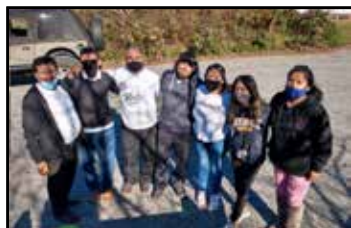
Hickory Seventh-day Adventist Church Hickory, NC