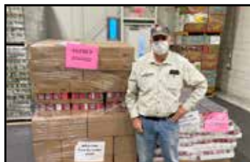
Feed My Lambs Wadesboro, NC