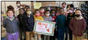
Sadler Elementary Gaston County