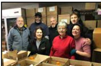
Pickens Seventh-day Adventist Church Pickens, SC