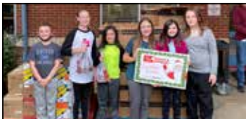
Love Memorial Elementary Lincoln County