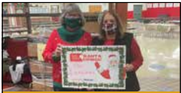
Star Elementary Montgomery County