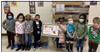
James Love Elementary Cleveland County