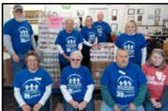
Dallas High Shoals Christian Ministry Dallas, NC