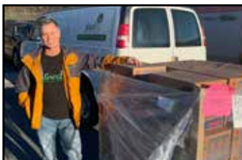
Feed NC Mooresville, NC