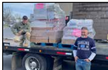
Providence Church of God Locust, NC