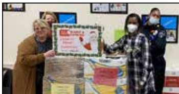
Ebenezer Avenue Elementary York County