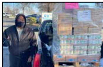
Double Oaks Charlotte, NC