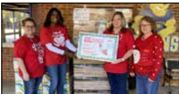
Luther Vaughan Elementary Cherokee County