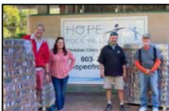
HOPE Rock Hill Rock Hill, SC