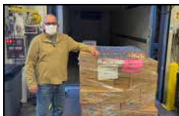
Food for Families Indian Trail, NC

Every year during our Second Harvest Food Bank of Metrolina Agency Conference, we recognize agencies who have gone above and beyond. This year, we surprised these agencies with $2,000 of food of their choice. Award winners included Dallas High Shoals Christian Ministry, Burke United Christian Ministries, The Manna House Pantry, Feed NC, Providence Church of God, HOPE Rock Hill, Feed My Lambs, Double Oaks, Food for Families, 5 Point Church, Pickens Seventh-day Adventist Church and Hickory Seventh-day Adventist Church. Huge thanks to all of our agencies! We could not feed all those who are hungry without our dedicated agencies.