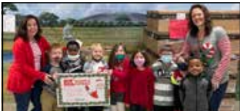
S. Ray Lowder Elementary Lincoln County